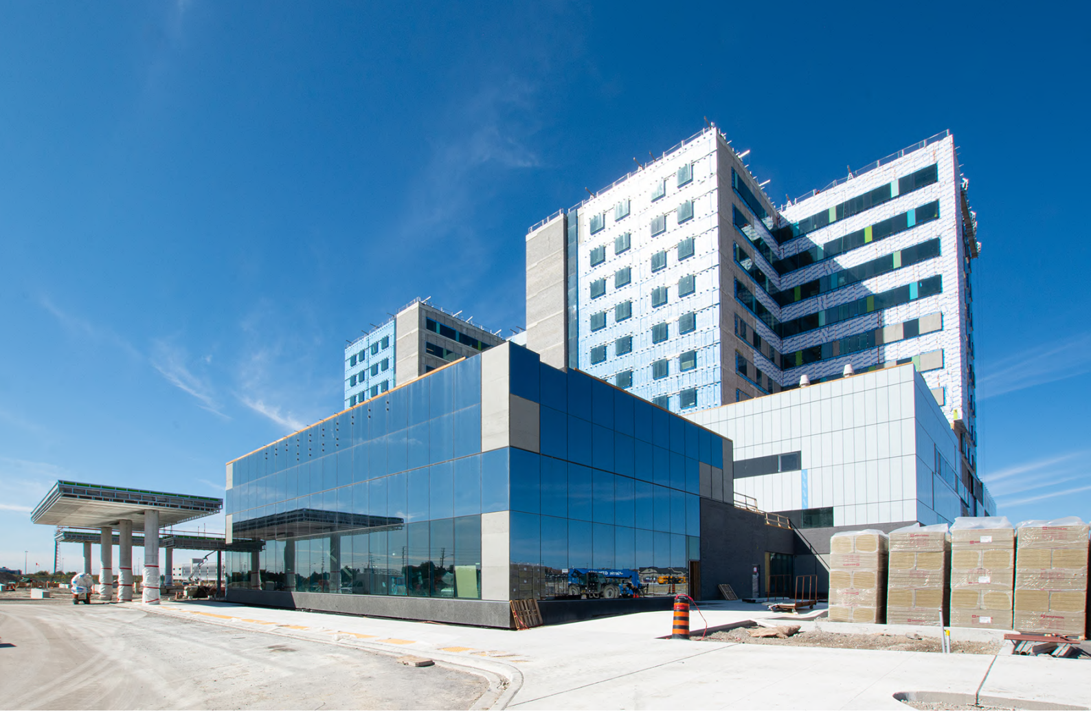
Picture of the learning centre at the new Mackenzie Vaughan smart Hospital

Philips is committed to building sustainable partnerships addressing the quadruple aim